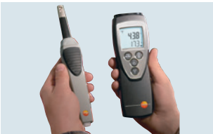
testo 625 with radio handle and radio module