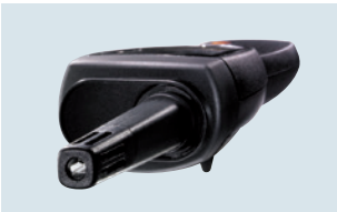
testo 625 with attached probe head