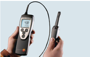
Moisture probe head via handle with probe wire