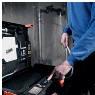
Automatic tightness test