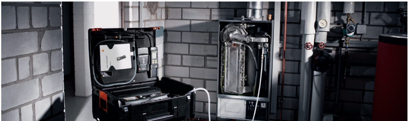
Automatic servicability test with gas-feed appliance with connection to the gas boiler