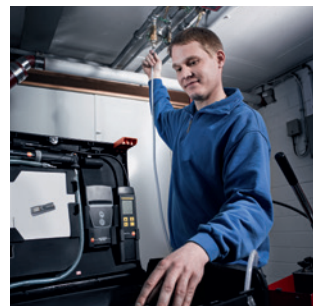
Drinking and waste water test with high-pressure probe up to 25 bar